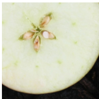
APPLE CIDER VINEGAR